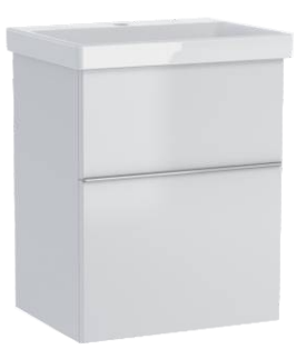
vanity unit Vea 50 (w/h/d) 46/57/35 Ref. No. 003272