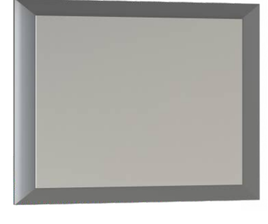
mirror 75 (w/h/d) 75/60/2 Ref. No. 002820