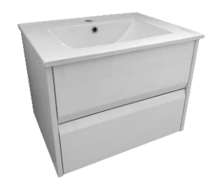
vanity unit Visage 50 (w/h/d) 50/47/40 Ref. No. 003285 vanity unit Livia 60 (w/h/d) 59,8/45/45,5 Ref. No. 003078

body and fronts 3 times painted with Italian, non-fading, high gloss lacquer. Shelves made of 16mm furniture board.