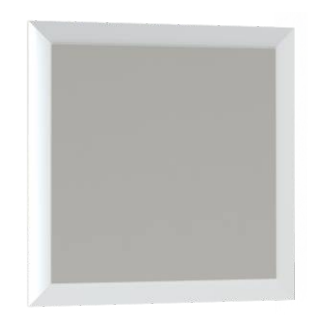
mirror 60 (w/h/d) 60/60/2 Ref. No. 002812