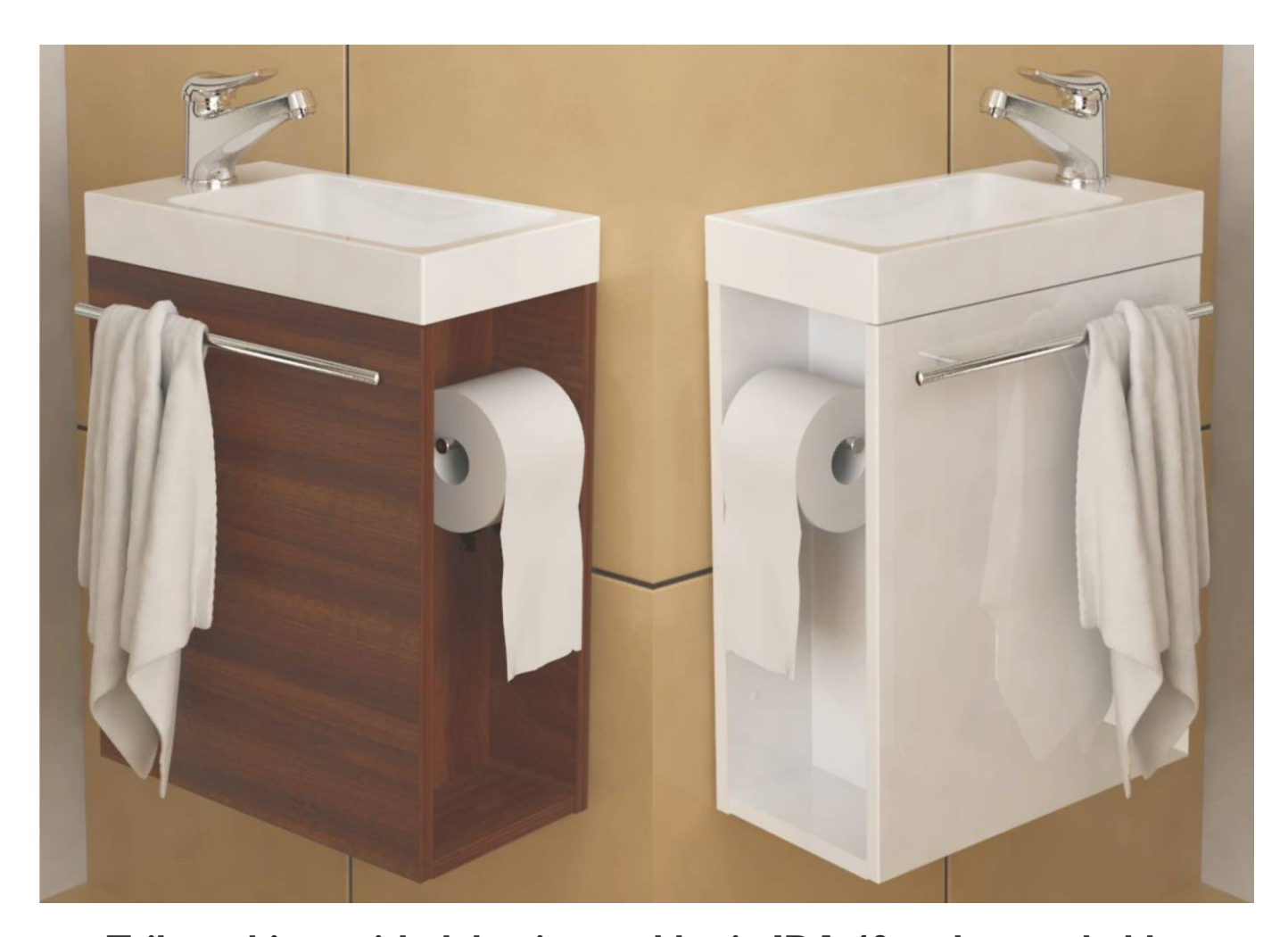
Toilet cabinet with dolomite washbasin IDA 40 and paper holder