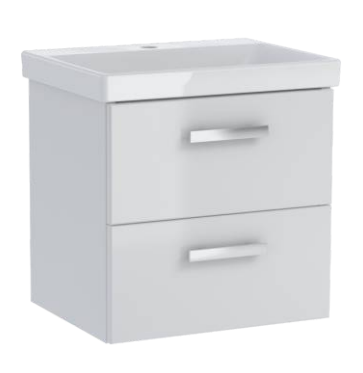
vanity unit Vea 50 (w/h/d) 46/45/35 Ref. No. 003371