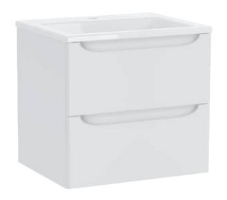
vanity unit Visage 50 (w/h/d) 50/45/39 Ref. No. 003365

Body and fronts 3 times painted with Italian, non-fading, high gloss lacquer.