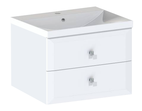
vanity unit Vena 75 (w/h/d) 50/74,5/45,5 Ref. No. 002808