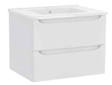
vanity unit Livia 60 (w/h/d) 60/45/46 Ref. No. 003367