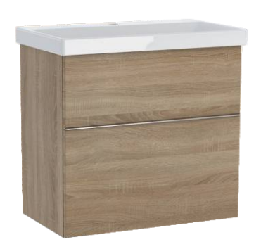
vanity unit Vea 65 (w/h/d) 61/57/35 Ref. No. 003290