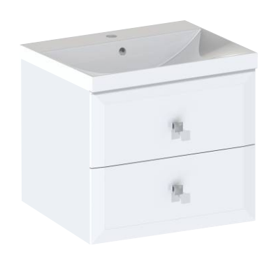
vanity unit Vena 60 (w/h/d) 50/59,5/45,5 Ref. No. 002807