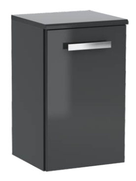
floor cabinet 30 (w/h/d) 30/50/28 Ref. No. 003378