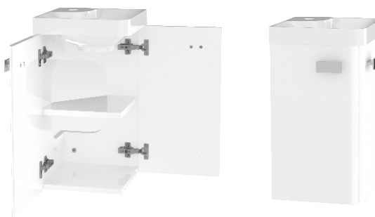
corner 30 with dolomite washbasin (w/h/d) 30/55/30 Ref. No. 002912