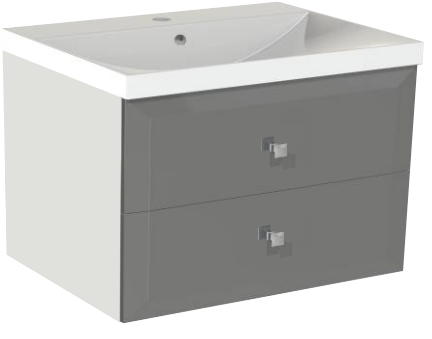
vanity unit Vena 75 (w/h/d) 50/74,5/45,5 Ref. No. 002815