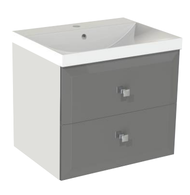
vanity unit Vena 60 (w/h/d) 50/59,5/45,5 Ref. No. 002814