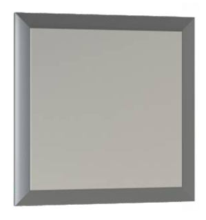
mirror 60 (w/h/d) 60/60/2 Ref. No. 002819