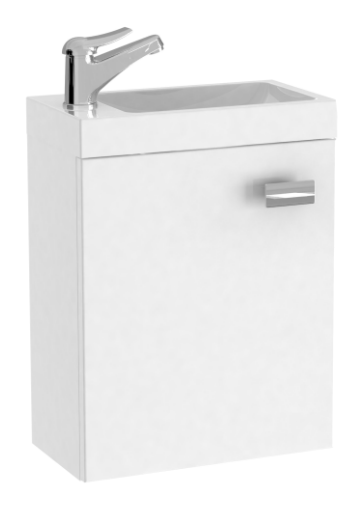
vanity unit IDA 40 (w/h/d) 40/47/22 Ref. No. 002464