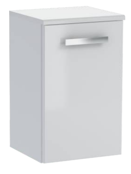
floor cabinet 30 (w/h/d) 30/50/28 Ref. No. 003373