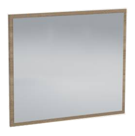
mirror 60 (w/h/d) 70/60/2 Ref. No. 003294