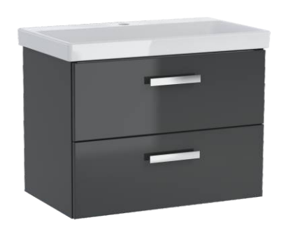
vanity unit Vea 65 (w/h/d) 61/45/35 Ref. No. 003377