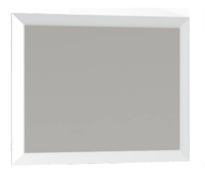
mirror 75 (w/h/d) 75/60/2 Ref. No. 002813