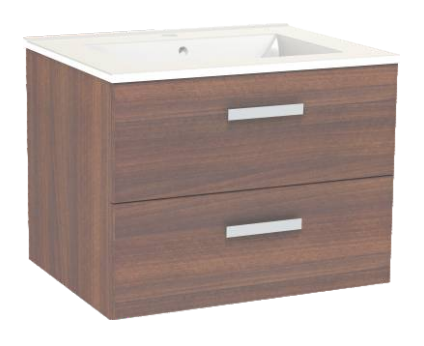
vanity unit Livia 60 (w/h/d) 60,5/45/46,5 Ref. No. 002626 two drawers