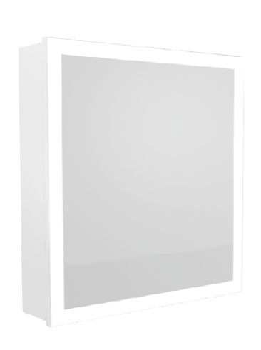
cabinet LED mirror 56 (w/h/d) 56/60/12,5 Ref. No. 002910 door