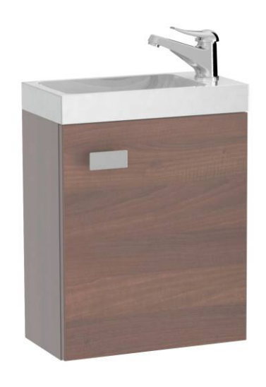
vanity unit IDA 40 (w/h/d) 40/47/22 Ref. No. 002509