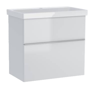
vanity unit Vea 65 (w/h/d) 61/57/35 Ref. No. 003273