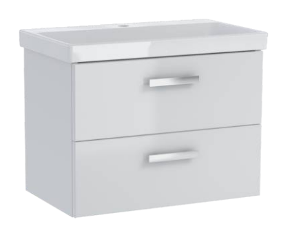
vanity unit Vea 65 (w/h/d) 61/45/35 Ref. No. 003372