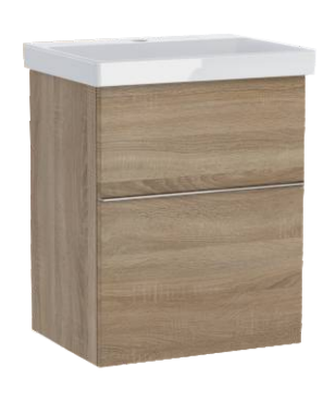
vanity unit Vea 50 (w/h/d) 46/57/35 Ref. No. 003289