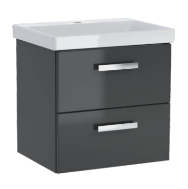
vanity unit Vea 50 (w/h/d) 46/45/35 Ref. No. 003376