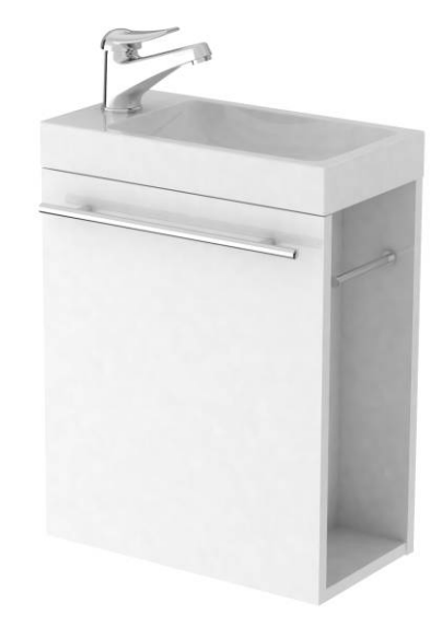
Toilet cabinet white for IDA 40 washbasin PH (w/h/d) 40/47/22 Ref. No. 002339