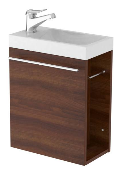
Toilet cabinet tabaco for IDA 40 washbasin PH (w/h/d) 40/47/22 Ref. No. 002423